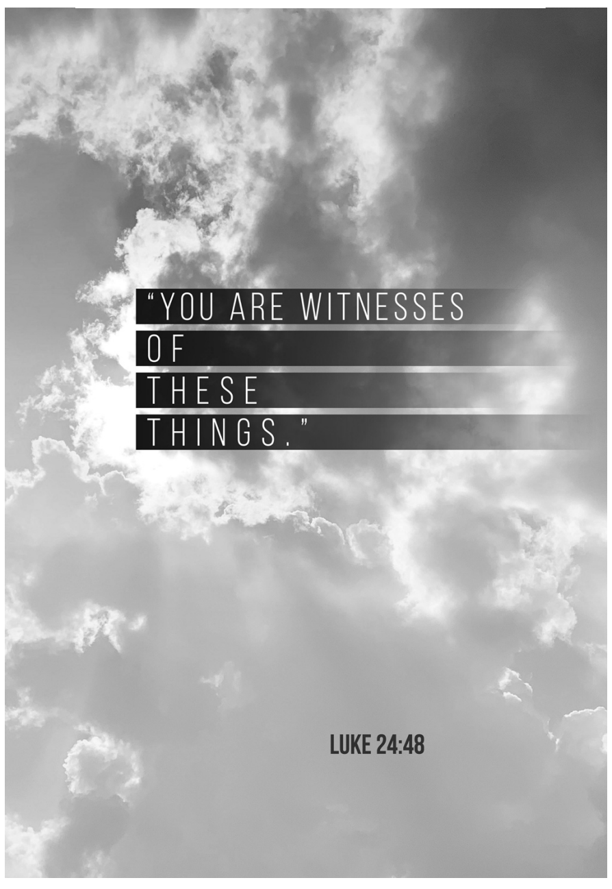
Your Church for Worship and the Arts! WORD | CONNECTION | MUSIC